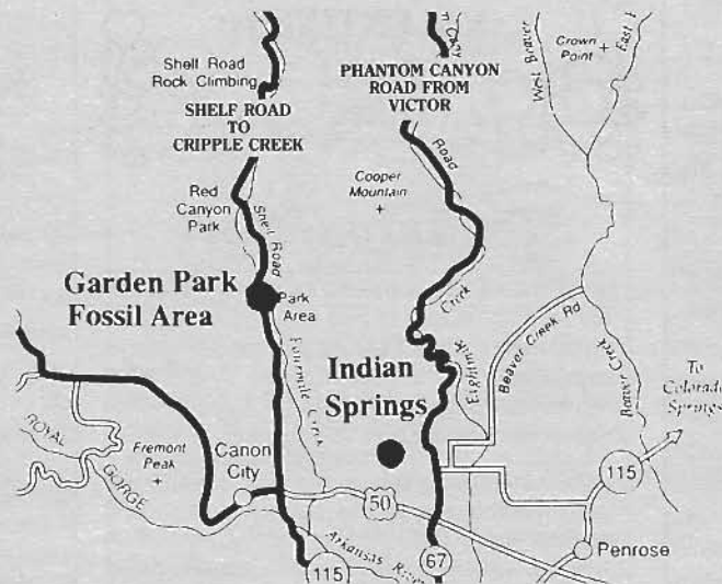
Indian Springs is a Trace Fossil area; tracks there are said to have been made 450 million years ago.

Memberships in the Garden Park Paleontology Society are $15 / Individual ($5 / Senior) or $25 / Family. Members get discounts, a members' field day, and a quarterly newsletter. Mailing address is P.O. Box 313, Canon City, CO 81215.