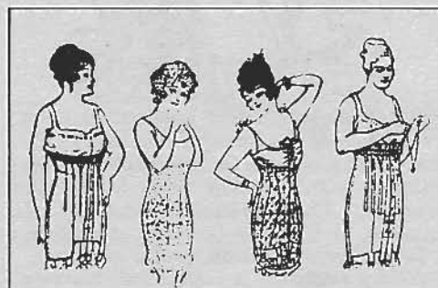
Who wouldn't be able to find a suitable corset with 250 to choose from at the January 1919 sale at Kaufman's, with such well-known brands as Warner, Redfeam, Royal Worcester, Kabo, and Bon Ton.

★ Downtown merchants opposed decision of the Colorado Springs Light, Heat & Power company to discontinue its centralized steam heating plant. Businessmen offered to guarantee profits if the system operated for at least one more year.