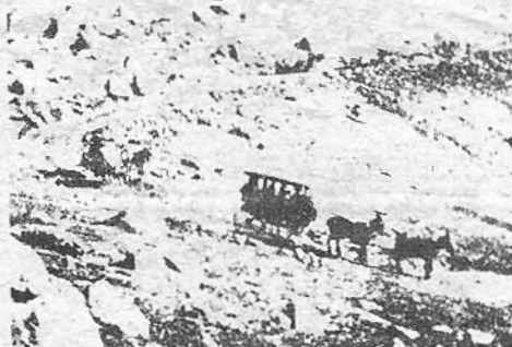
Wagons and teams on lower W's, Pikes Peak.

Victor had 478 pupils grades 1-12; Cripple Creek had 390.