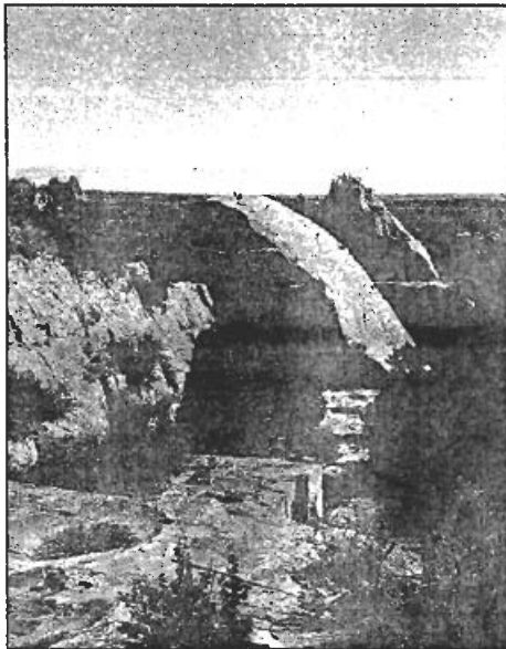
THE SNIDER QUARRY AS IT APPEARED IN 1999

In contrast to the simple low cost technology used in the Bott quarries, the Lyons sandstone quarries in Red Rock Canyon employed very expensive advanced machinery. Since the ridge which was quarried is a large competent mass of stone, quarrying involved cutting the stone rather than cleaving it. For each large block of stone quarried, steam powered channeling machines made cuts along each side of the block; holes were drilled beneath the block; and wedges were driven into these holes to break the block loose from the underlying sandstone. Once the block was cut free, it was loaded onto a railroad car by steam powered derrick.