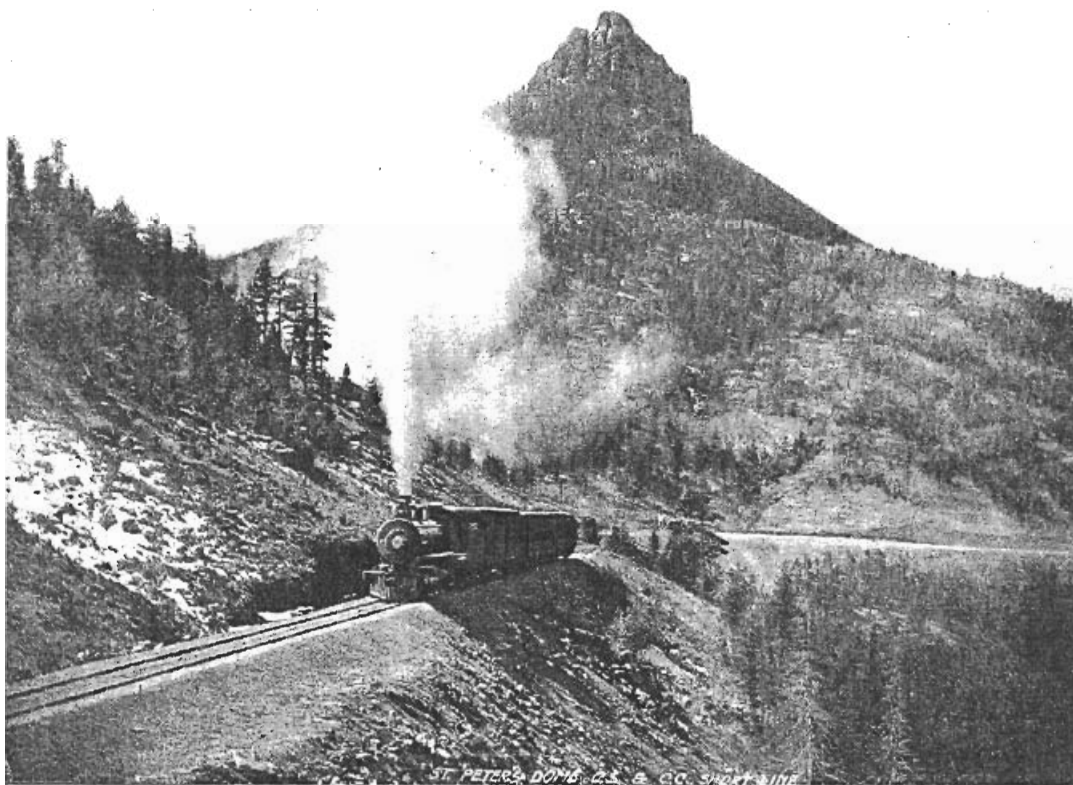
St Peters Dome on the Short Line