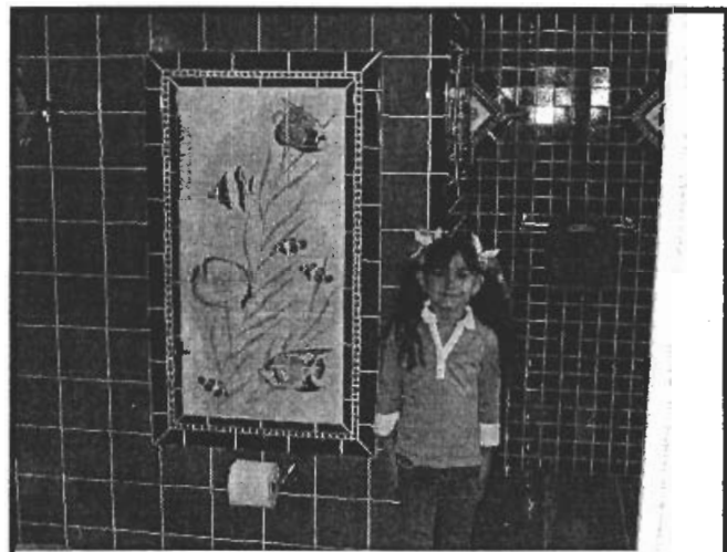
One of the fabulous bathrooms at Blue Skies Inn B&B

a little Tour History and background details. The first B&B Holiday Tour was held before the Old Colorado City History Center's restoration efforts were completed and the Center opened. Karla Heferan, an OCCHS member, was also a bed and breakfast owner and innkeeper. At her encouragement, five local area West Side B&B's were the first to coordinate, advertise, and open their homes to the public with all proceeds donated to the OCCHS. This small group funded the Tour's advertising, printing, and promotional efforts. They still do and it is much appreciated by the Old Colorado City Historical Society.