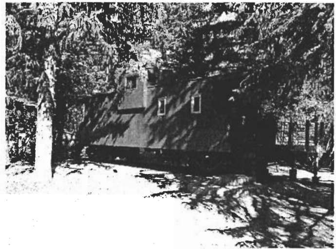
The Red Caboose at the Blue Spruce Inn in Cascade