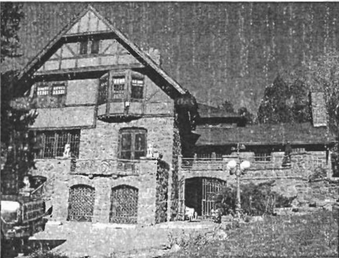
Onaledge in Manitou

Onaledge 336 El Paso Blvd. Manitou Springs, CO 80829