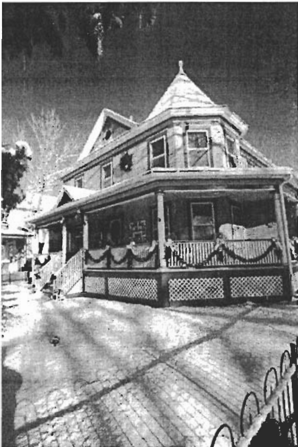
Holden House at Christmas