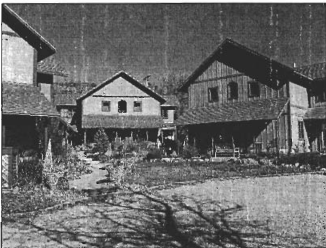
Blue skies Inn B&B

We thought this year you may be interested in