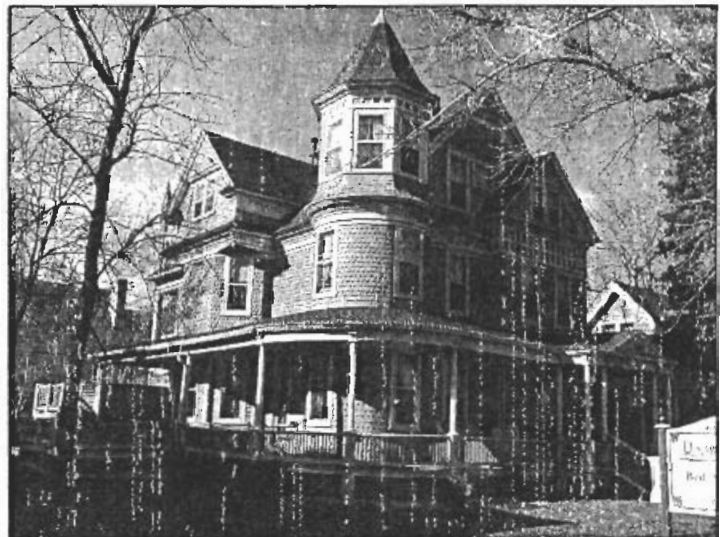
Room at the Inn B&B

Rockledge Country Inn 328 El Paso Blvd. Manitou Springs 80829