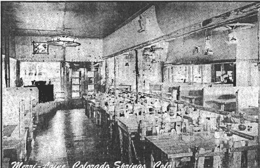
Post card from Merri-Laine