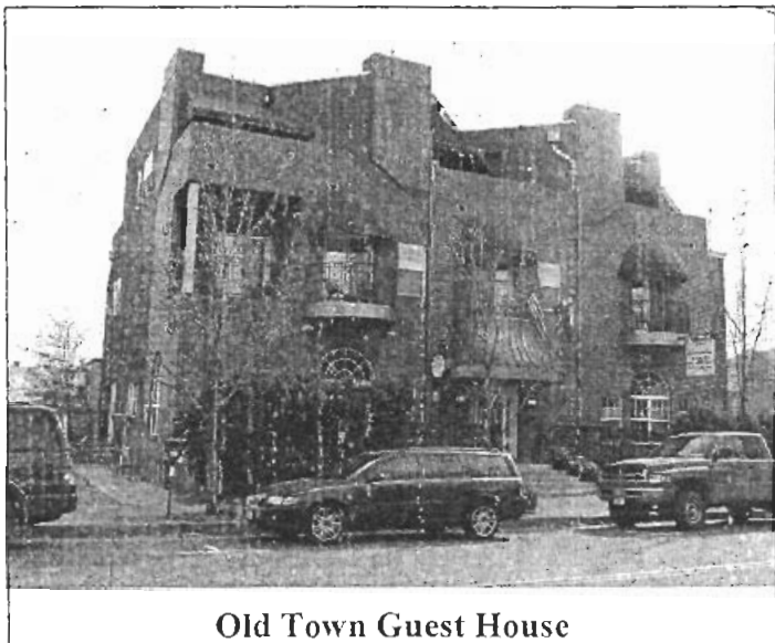
Old Town Guest House

Andy and Pat's Our Hearts Inn Old Colorado City 2215 W. Colorado Avenue was built in 1895 and has been filled with antiques and hand stenciled interiors. Includes 3 guest rooms and a cozy private cottage with cowboy decor. (719) 473-8684; (800) 533-7095; fax: (719) 634-