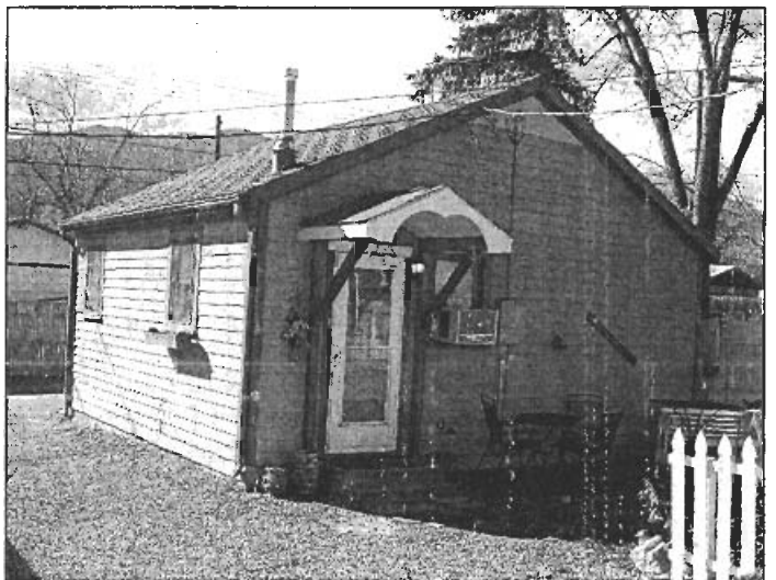
Cottage at Our Hearts Inn

fers a private and peaceful destination characterized