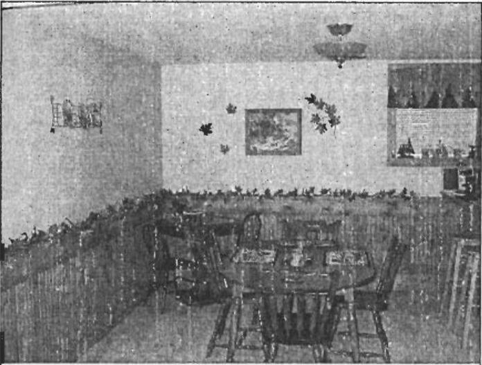
Cascade Mountain Lodge

with romantic waterfall and mood lights. (719) 684-777; (866) 772-9171; www.cascademtnlodge.com ;