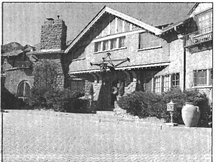
Rockledge Country Inn