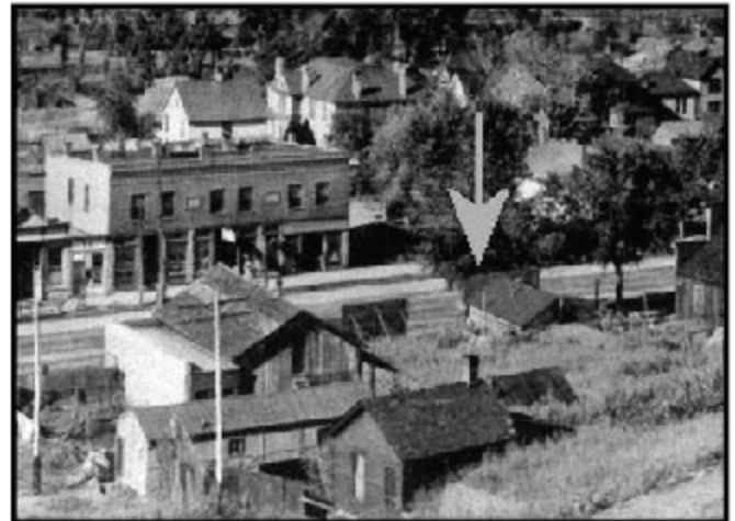
Original Cabin Location