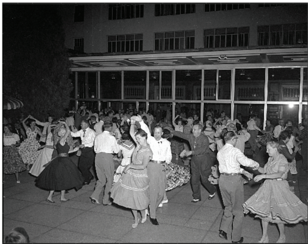
Dancing on the Broadmoor terrace 1957