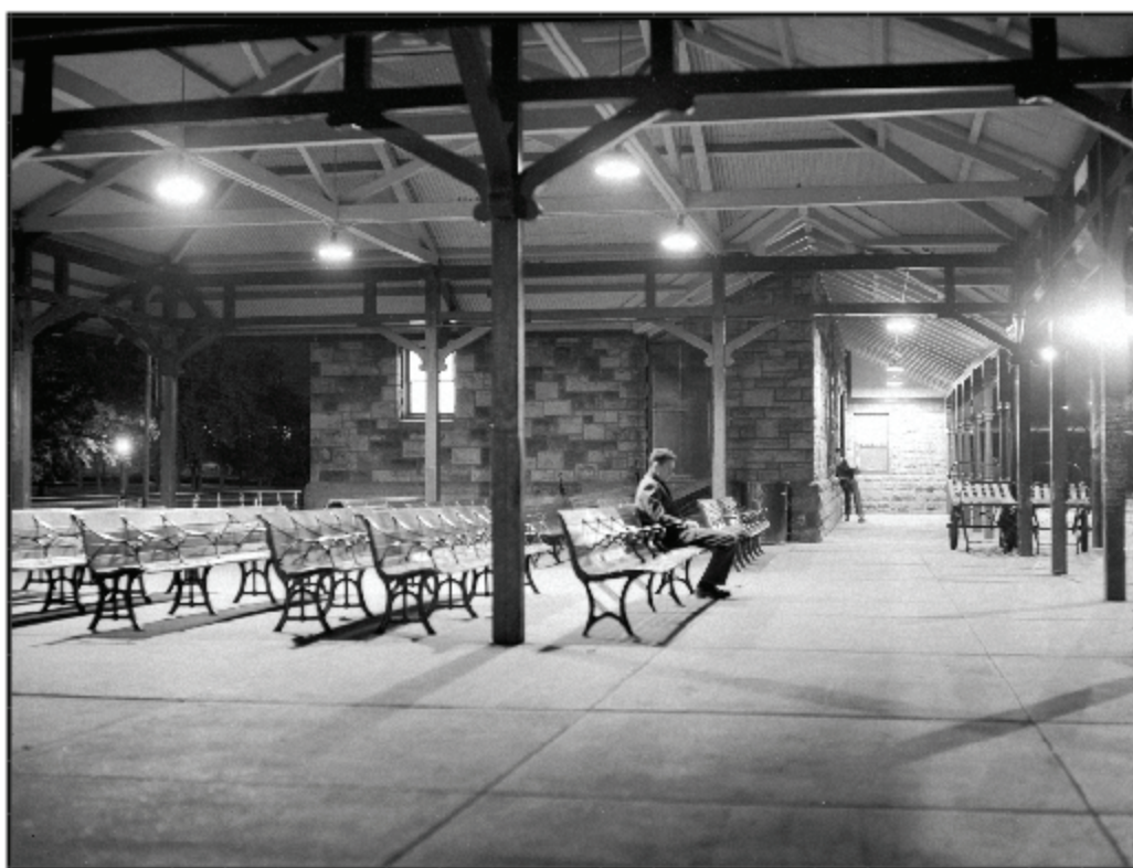
Waiting for a Train -D&RG Depot 1945