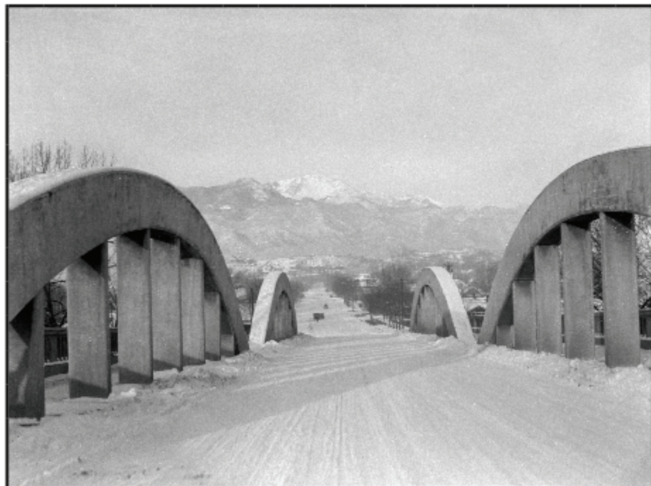
Bijou Street Bridge 1932