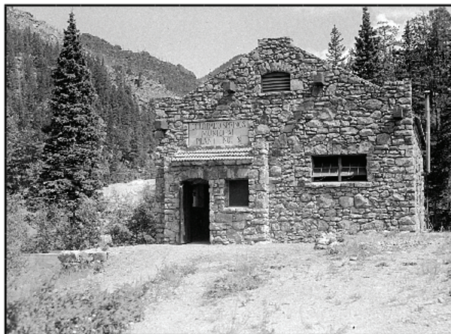
Ruxton Hydroelectric Plant 1932